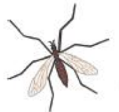
crane fly (daddy-long-legs)