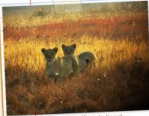
Two lionesses (female lions).

They typically inhabit areas of savannah and grassland.