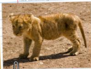
A lion cub.

The lion is an endangered species due to habitat loss and conflict with humans.